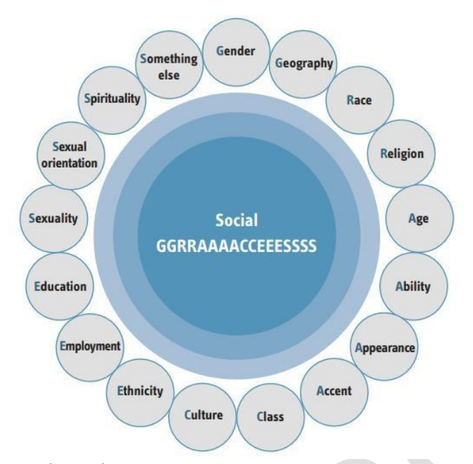
Figure: Burnham, J (2012)

Professionals will benefit in their practice from understanding and accepting any privilege they bring and equally where they may lack privilege. Attending to and reflecting on social graces can enable practitioners to be alert to their own preconceptions and bring to the fore areas of difference that risk being overlooked (Bronfenbrenner, 1979, in Birdsey & Kustner, 2020). It increases reflexivity and skills in responding to both sameness and difference (Nolte, 2017).